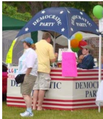
Adding new volunteers!